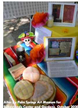
Altar by Palm Springs Art Museum for Sunnylands Center and Gardens, October 2020