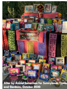
Altar by Animal Samaritans for Sunnylands Center and Gardens, October 2020