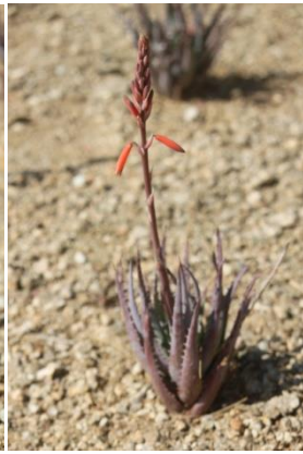
Blooms bottom up