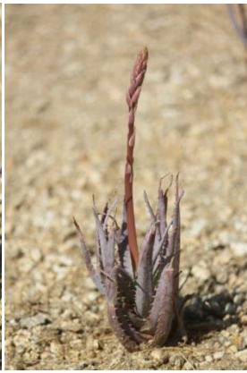
Blue elf stalk