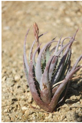
Blue elf budding